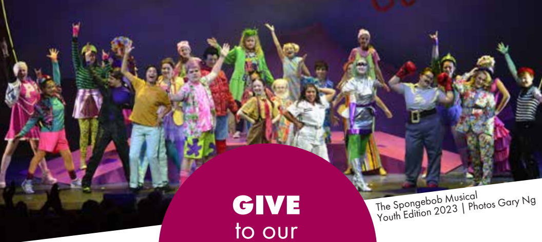
The Spongebob Musical Youth Edition 2023