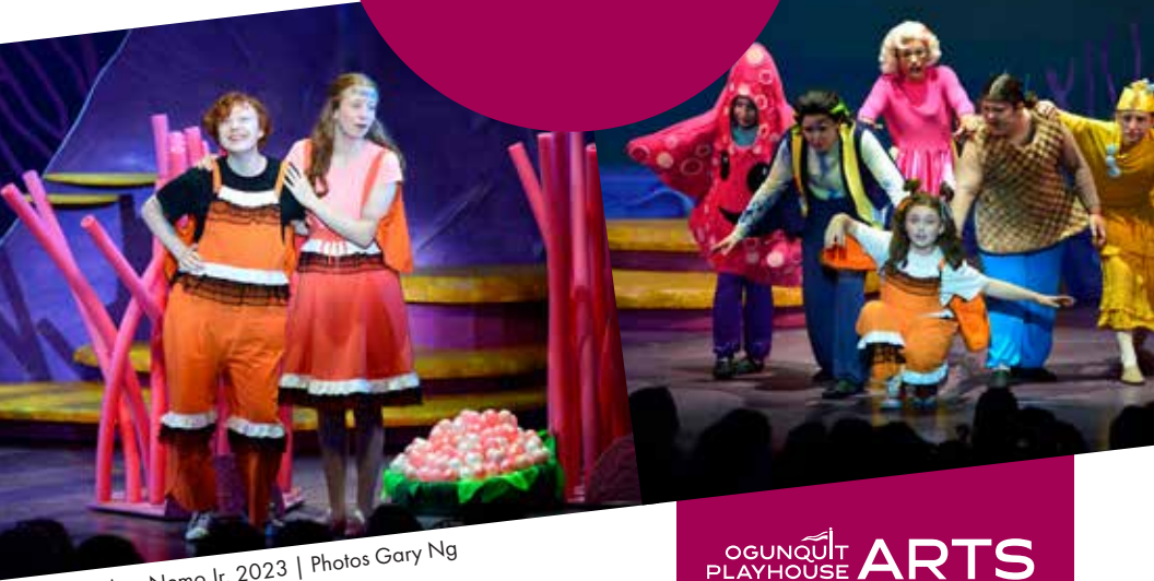
Finding Nemo Jr. 2023